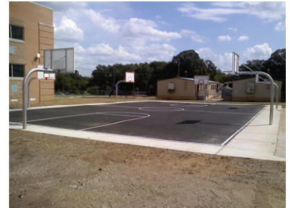
Sagamore Hill Elementary