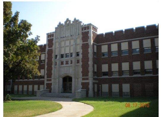
William James Middle School