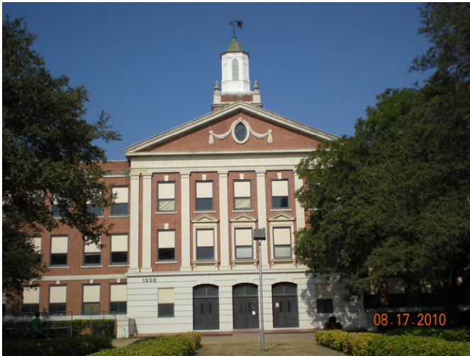
Polytechnic High School