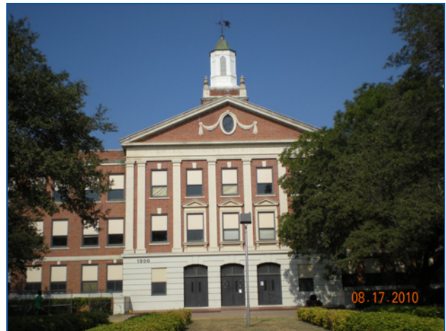
Polytechnic H. S.

1101 Nashville Street Fort Worth, TX 76105